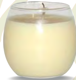
Candles for massage.

coconut husks with aromas that provide a sensation of relaxation and warmth.