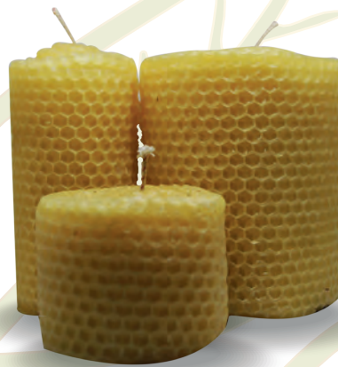
Aromatic candles in Bee Wax.

Candles made in beeswax with aroma and original color that together with its animal origin and cotton wicks are one hundred percent friendly with the environment.