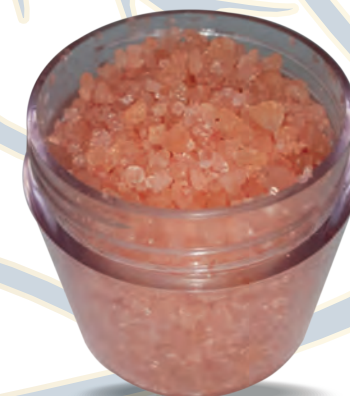
Bath Salts with Natural Essential Oils.

Deflate and relax the body, but also each of its formulas influence your mood by changing it and providing new emotional states.