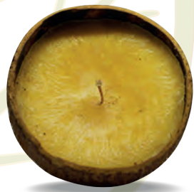
Aromatic candles in coco husks.

coconut husks with aromas that provide a sensation of relaxation and warmth.