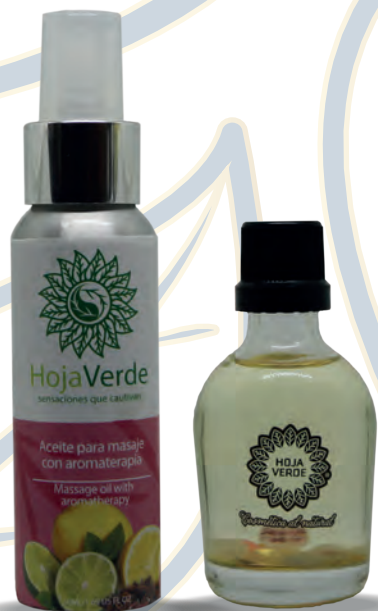
Oils for massage with aromatherapy.

They influence your mood by changing it and providing new emotional states.