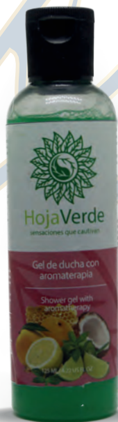
Body Shower Gel with Natural Essential Oils.

Being made with natural essences not only clean and moisturize, but also hydrates the skin in each of its aromas.