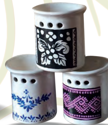
Aroma diffusers in ceramic and clay.

Candles made in beeswax with aroma and original color that together with its animal origin and cotton wicks are one hundred percent friendly with the environment.