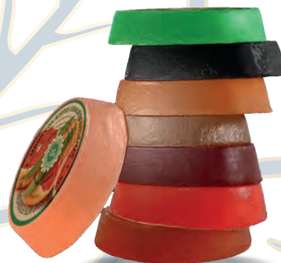
Glycerin and Neutral Soaps with Natural Essential Oils.

Being made with natural essences, Not only clean and moisturizes with each of its aromas but also influence your mood naturally changing your emotional states.