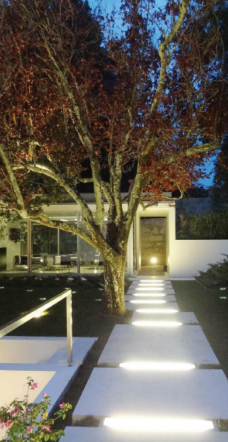
SPI HEADQUARTERS: NATIONAL LANDSCAPE ARCHITECTURE AWARD 2013 (LAURA COSTA)