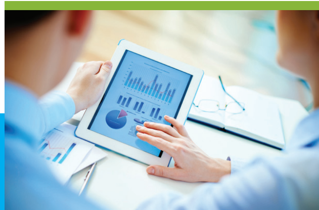
SCIENCE AND TECHNOLOGY

From its beginning the SPI Group has understood the importance of innovation in a dynamic and challenging global society. SPI has developed extensive knowledge in various aspects of the innovation ecosystem and applies this knowledge through a range of activities and services that ultimately foster and accelerate innovation in all its forms. Often we will work with clients to apply an open innovation approach to achieve their particular objectives.