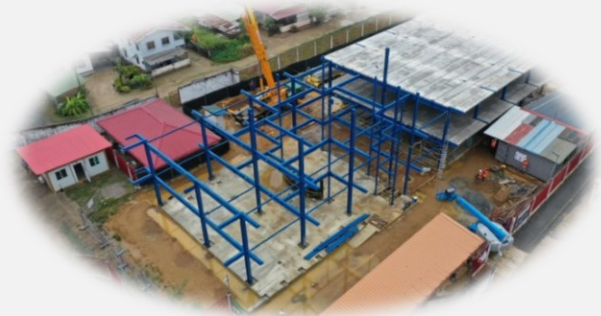
Heineken Suriname Head Office Construction HSE management/Working at Height Risk assessment & coordination