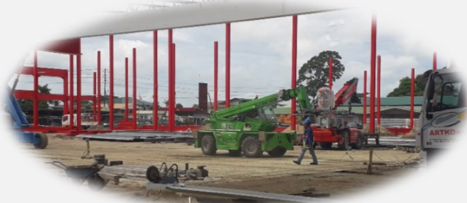
Rebuild Fernandes Bottling Construction HSE coordination

Some of our success completed projects for local construction clients for HSE project coordination, Job site Safety Management and Risk assessments