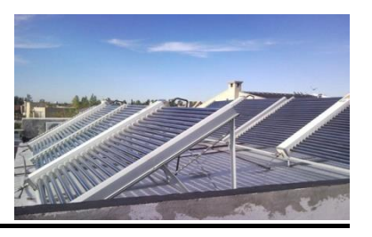
Heating water facilities

Feasibility study to Frigorífico Bajo Cero