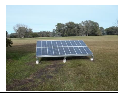
PV for pumping water