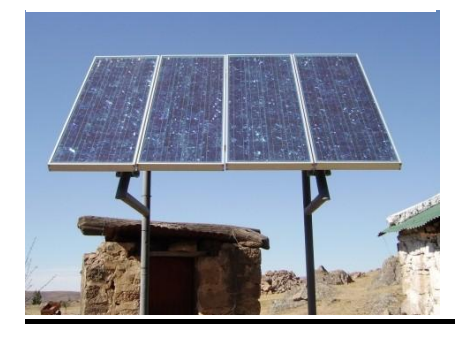
PV on farm in Córdoba