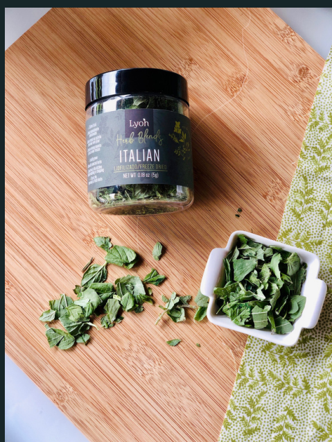
French Blend 0.26oz Freeze dried onion, celery, leek, parsley, thyme and bay leaves