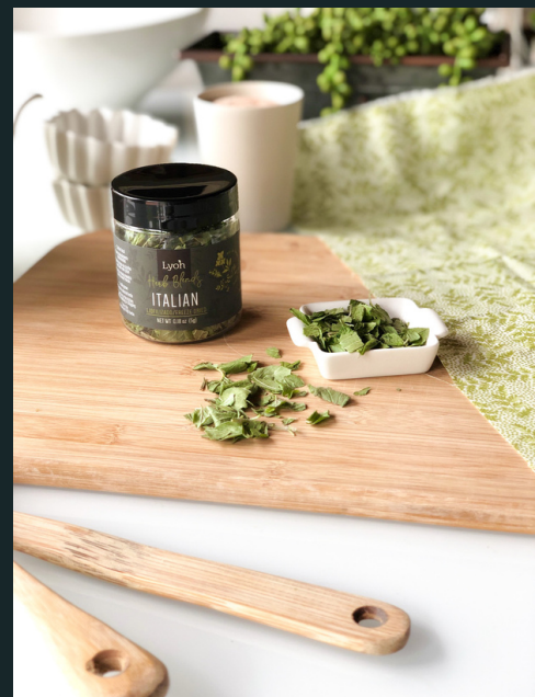
Italian Blend 0.18oz Freeze dried marjoram, sage, rosemary, basil and thyme