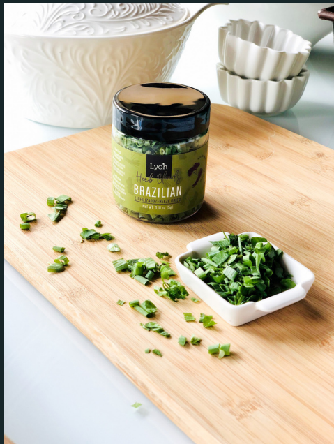
Brazilian Blend 0.18oz Freeze dried chives and parsley