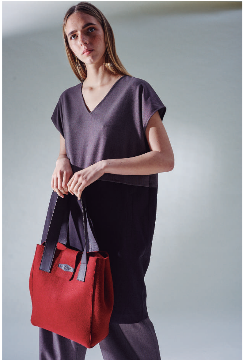
Dianella bag. Made in Alpaca Felt