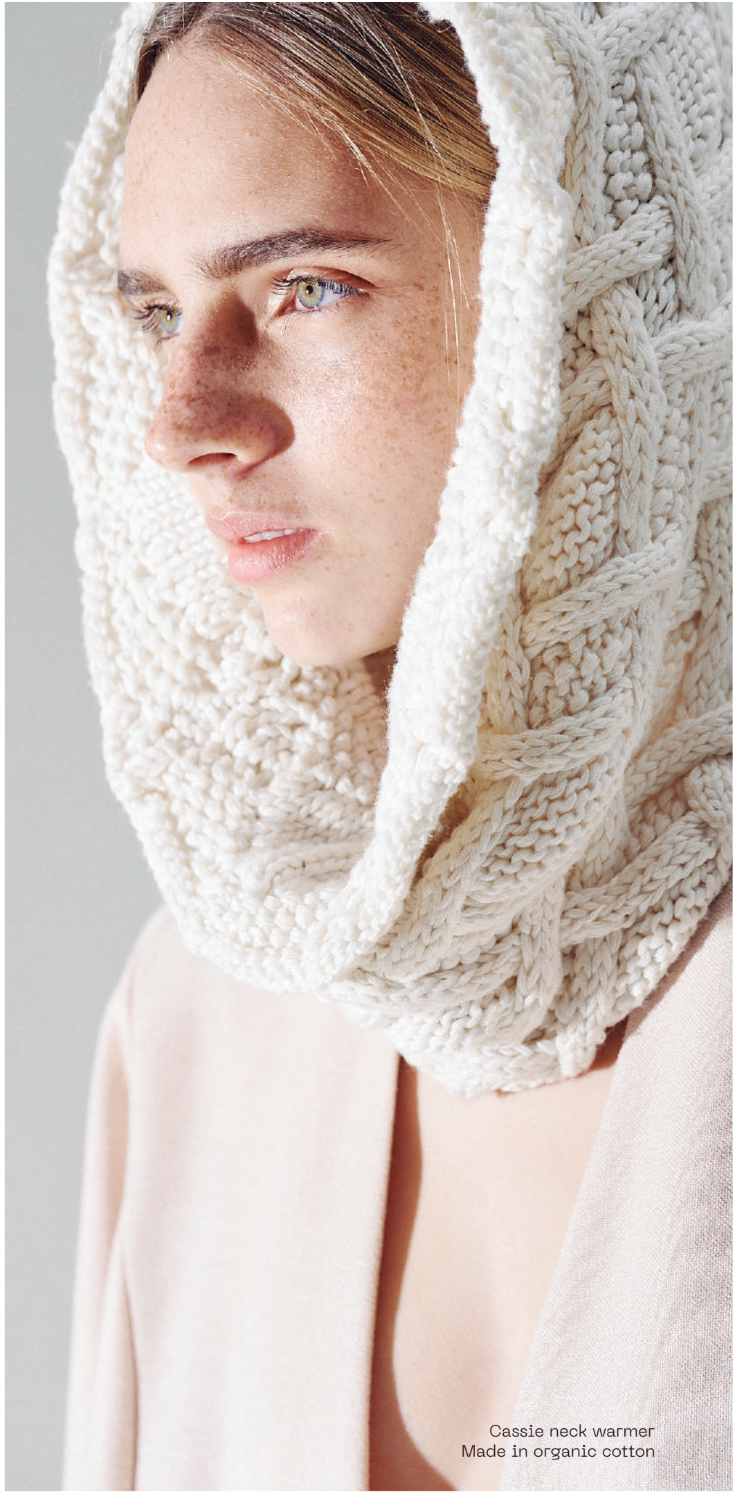
Cassie neck warmer Made in organic cotton