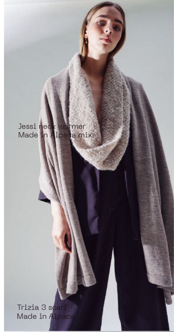
Jessi neck warmer Made in Alpaca mix