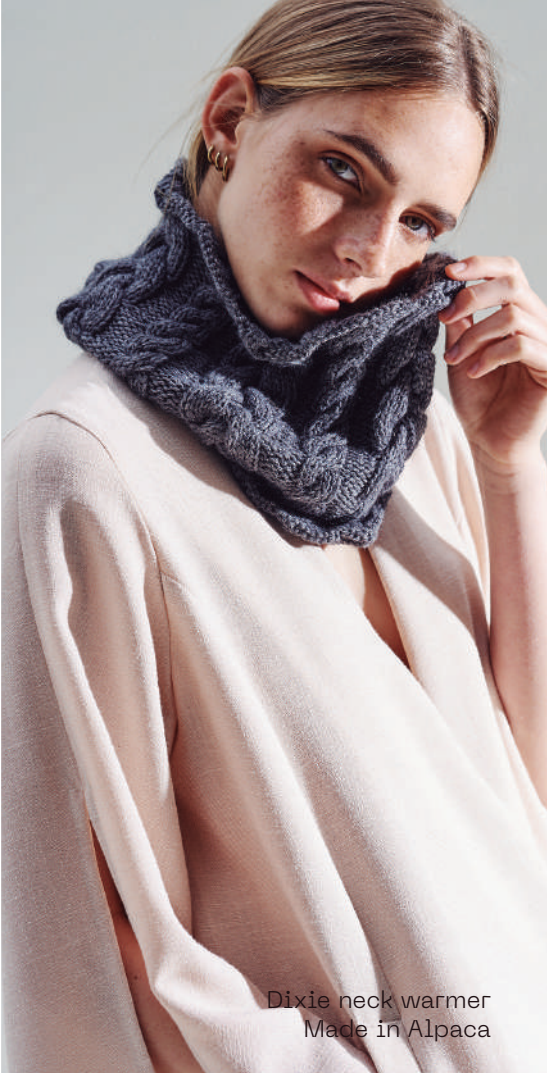
Dixie neck warmer Made in Alpaca