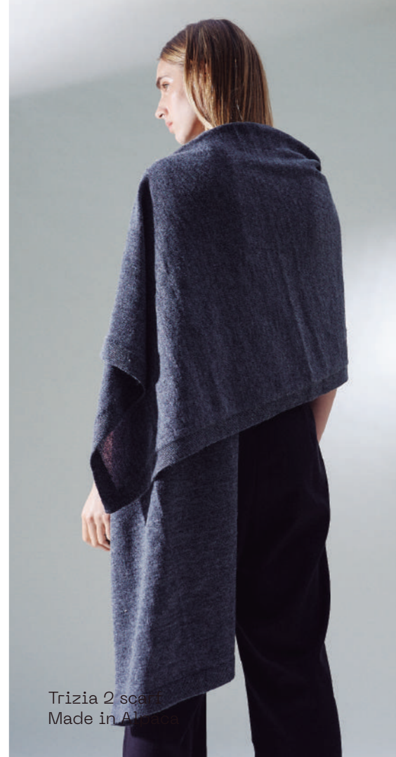
Trizia 2 scarf Made in Alpaca