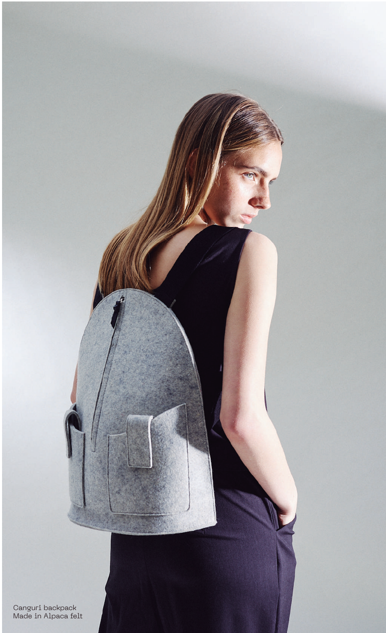
Canguri backpack Made in Alpaca felt