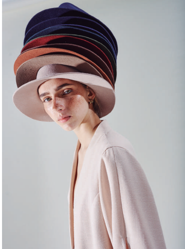
Aspen Hat Made in Sheep wool felt