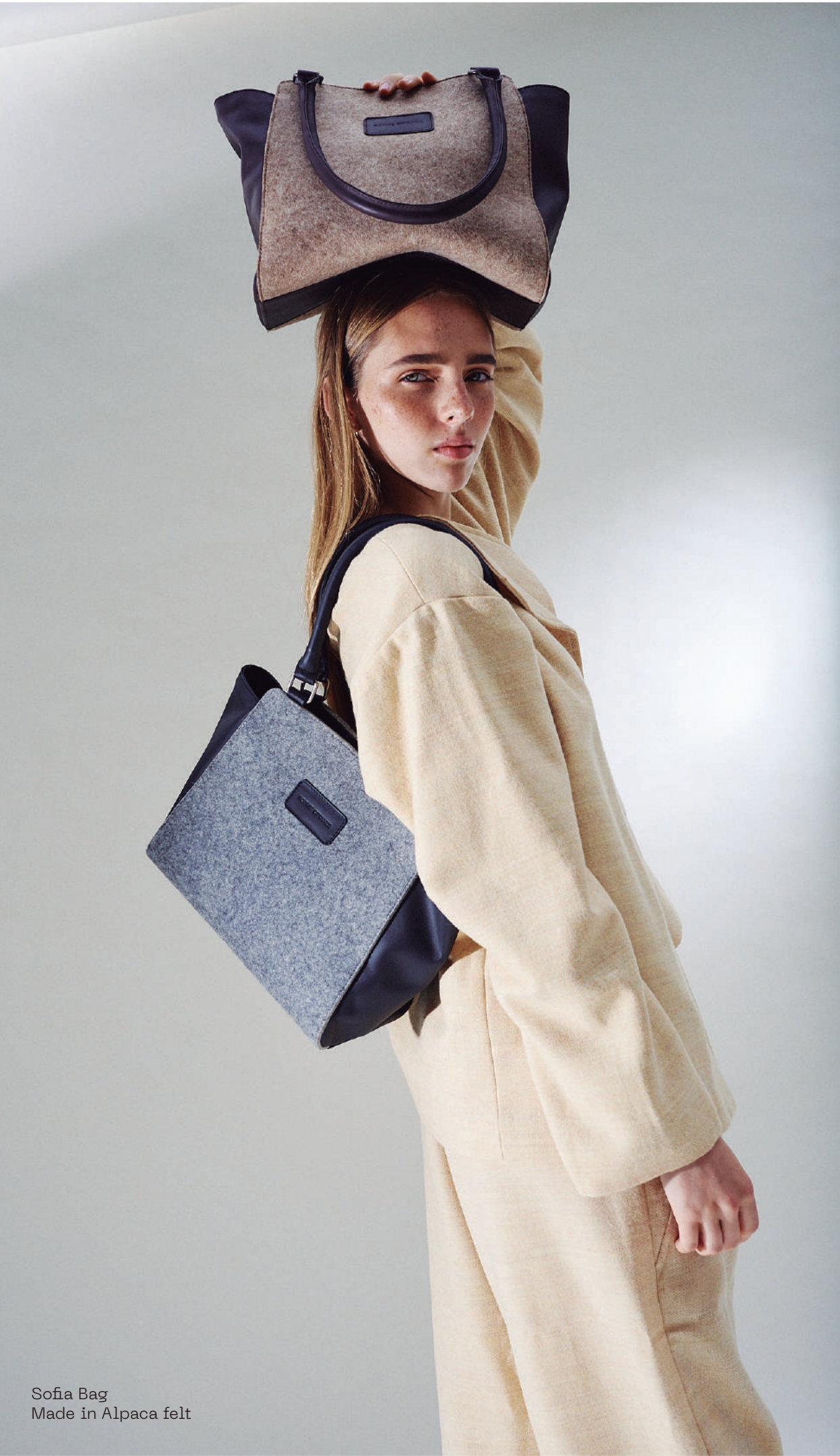
Sofia Bag Made in Alpaca felt