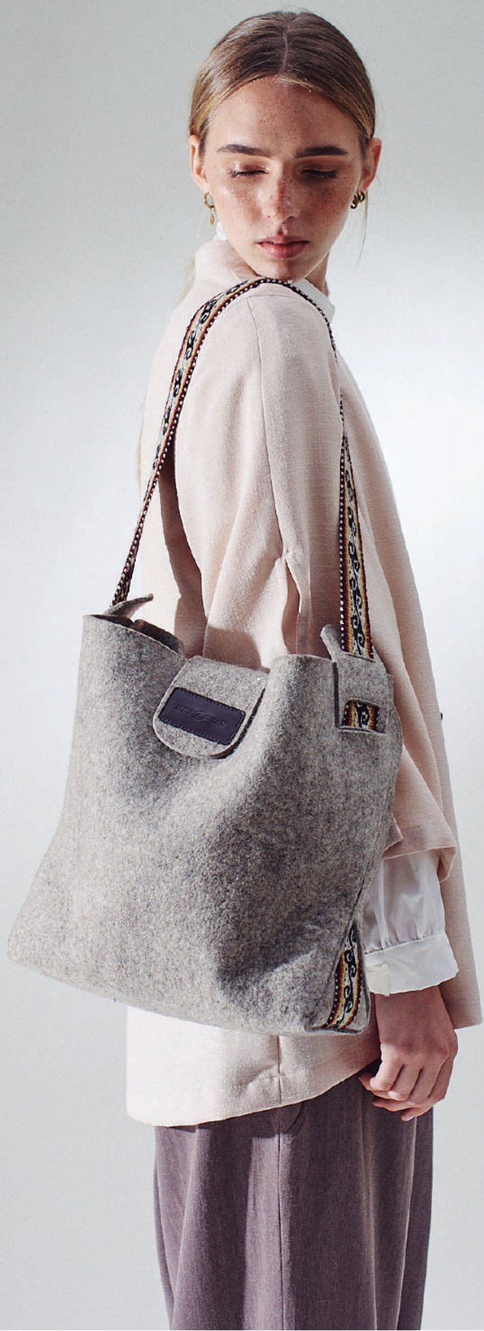
Clarette haversack Made in Alpaca felt