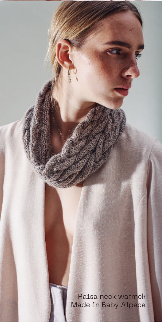
Raisa neck warmer Made in Baby Alpaca