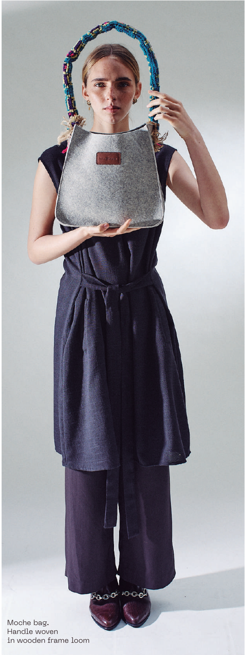
Moche bag. Handle woven in wooden frame loom