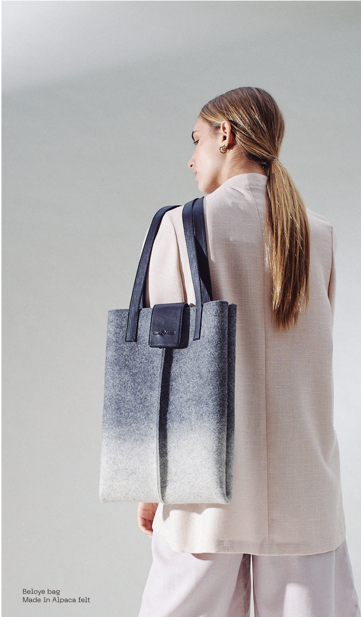
Beloye bag Made in Alpaca felt