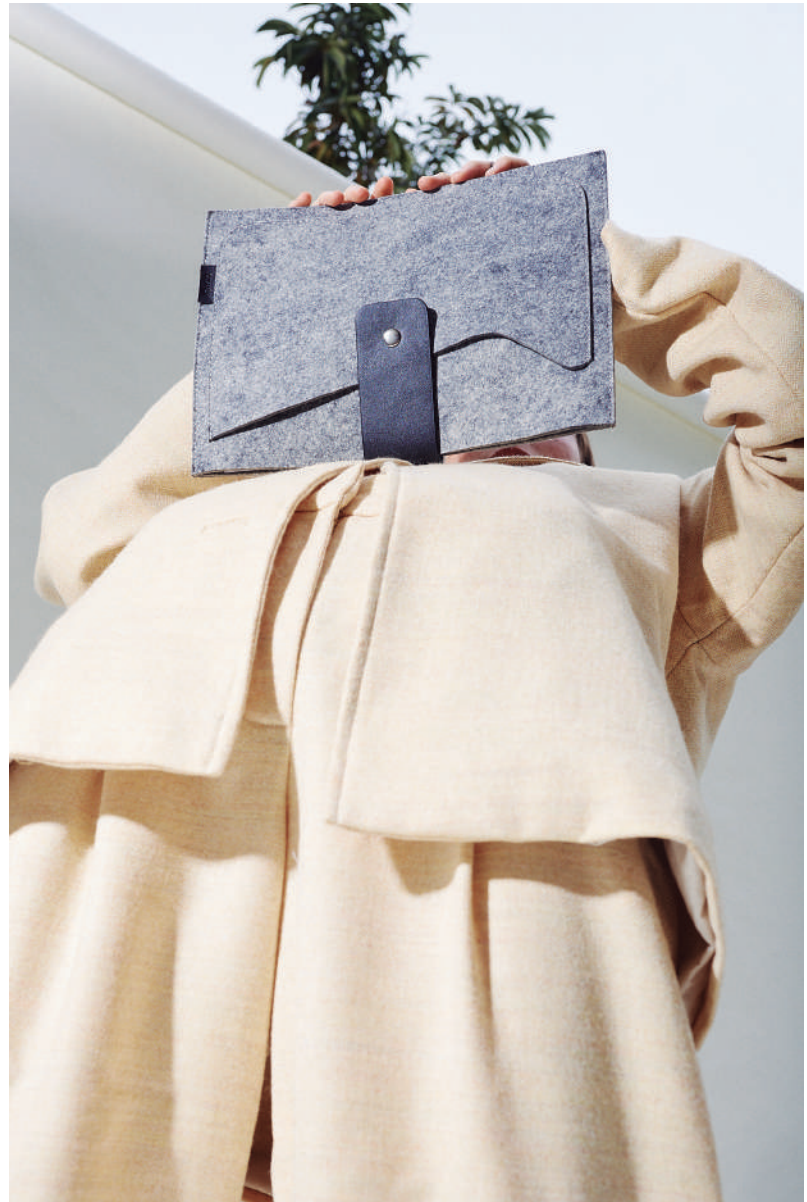
Kyndal laptop case Kander tablet case Made in Alpaca felt