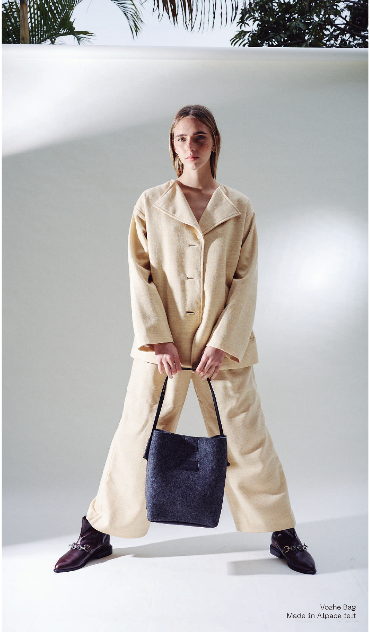
Vozhe Bag Made in Alpaca felt