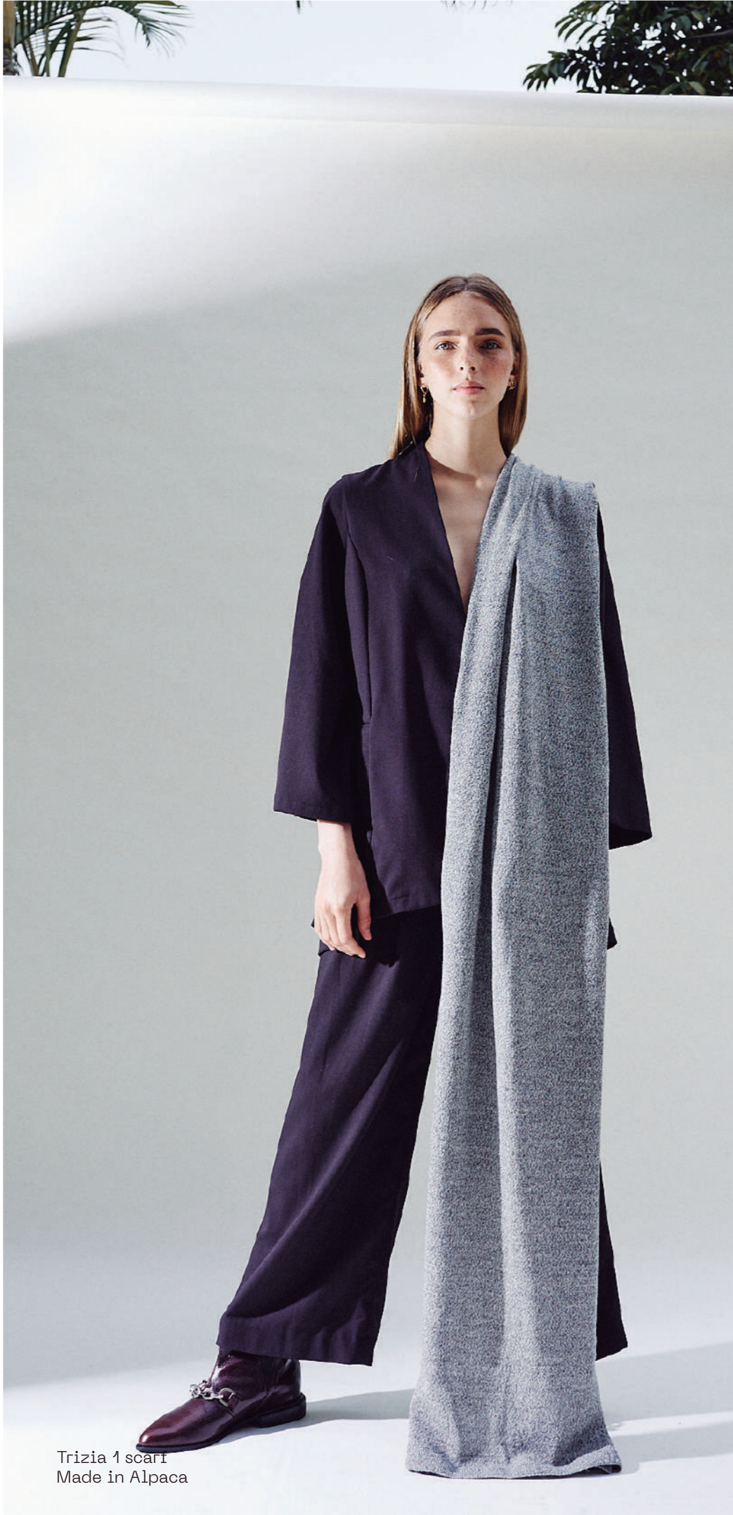
Trizia 1 scarf Made in Alpaca