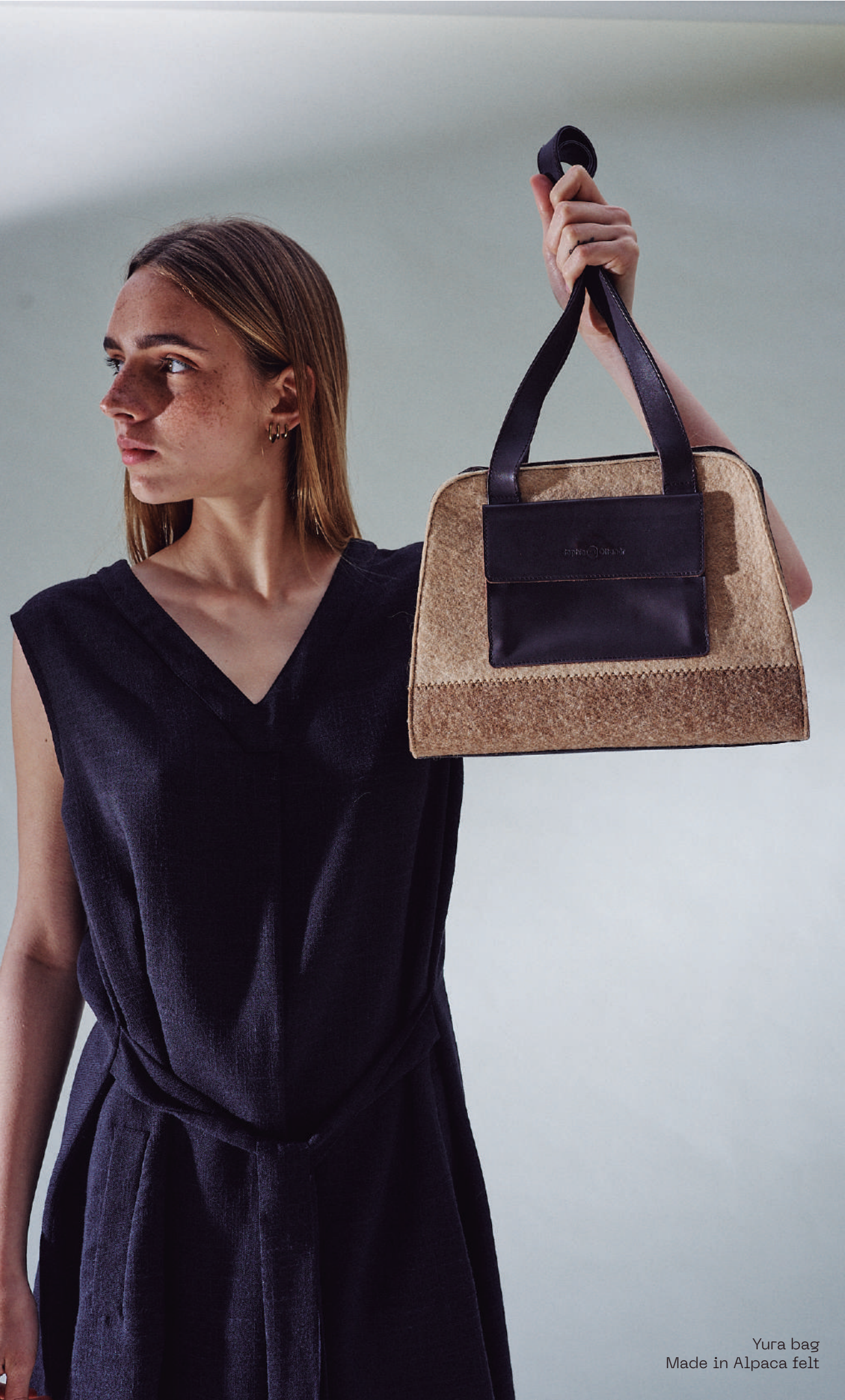
Yura bag Made in Alpaca felt