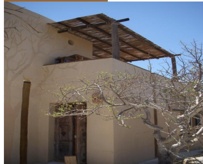
Classic ecological house