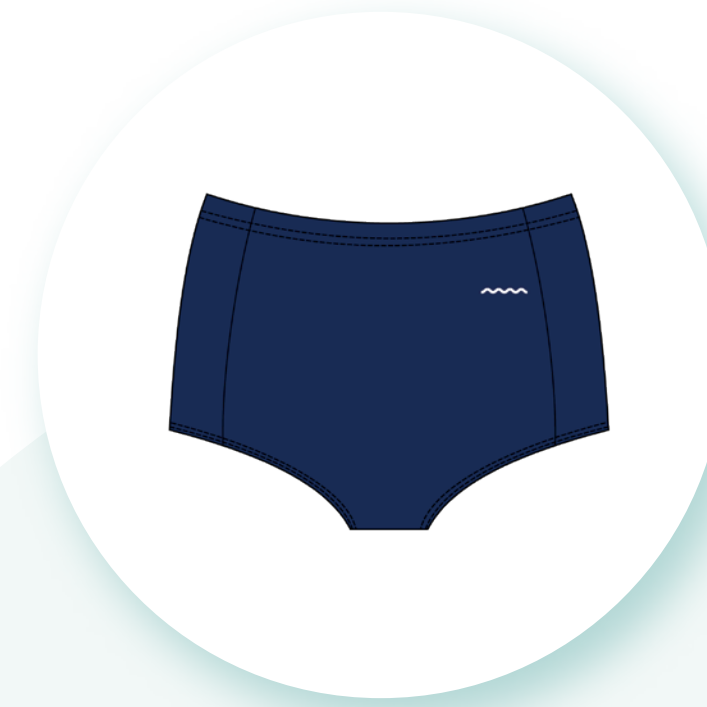
SUPER BOXER TRUNKS