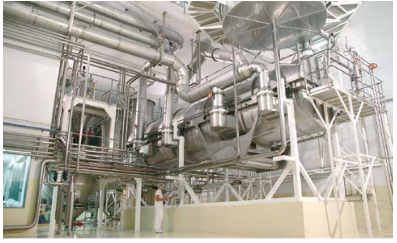
Simulación de texto. Simulación de texto.