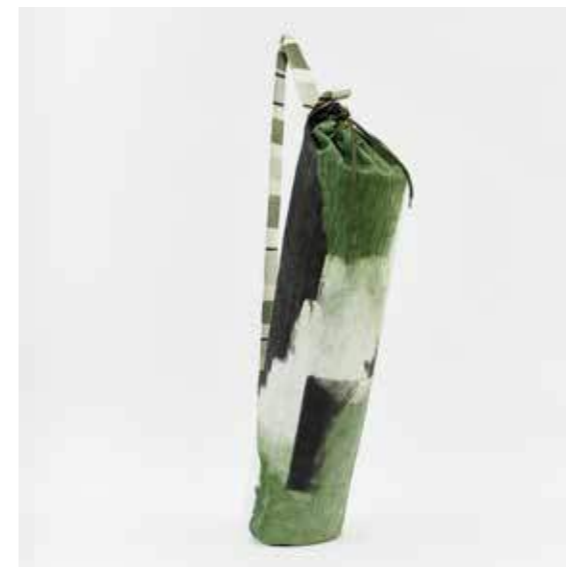
Moss / SKU BYCMS