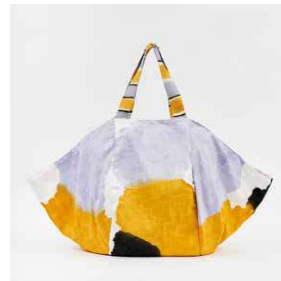
Yellow & Purple / SKU BXLYP