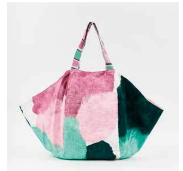
Green & Pink / SKU BXLGP