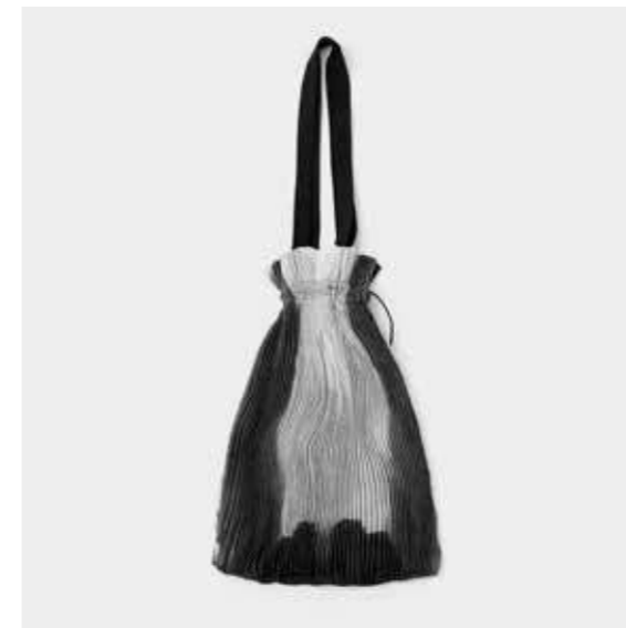
Blue / SKU BTPGY