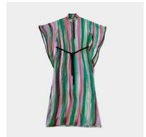
Green & Pink / SKU TCGP2