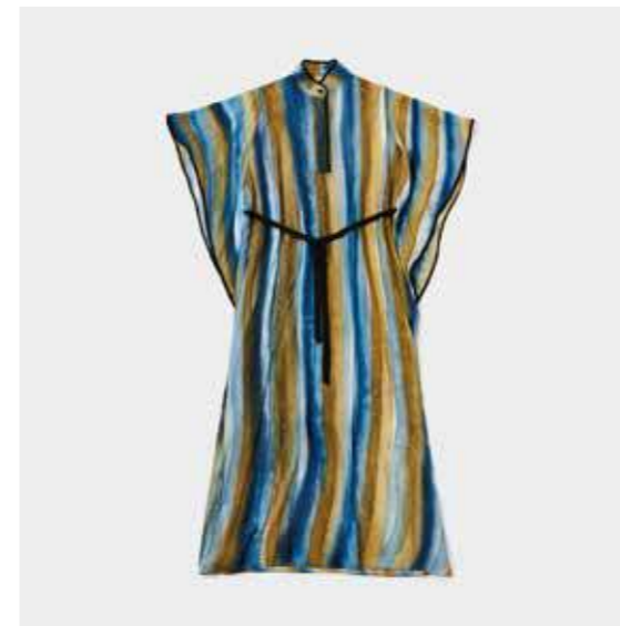
Gold & Blue / SKU TCBG2