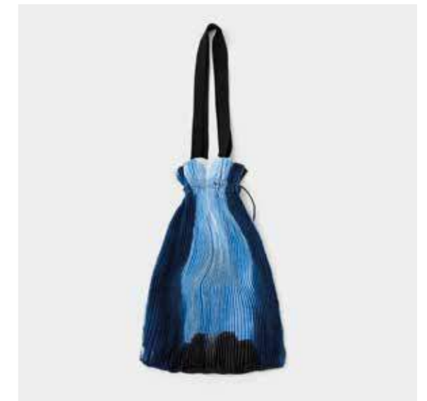
Grey / SKU BTPBE