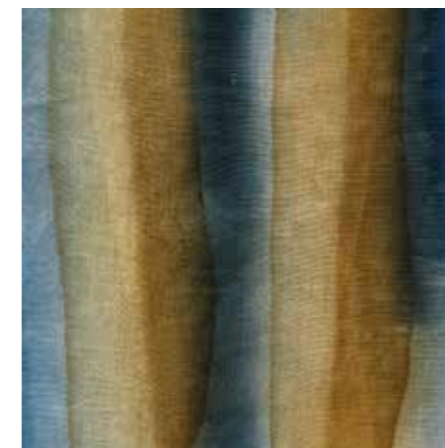
Gold & Blue / SKU BECBG