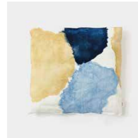
Gold & Blue 20" x 20" / SKU HCLBG1 24" x 24" / SKU HCLBG3