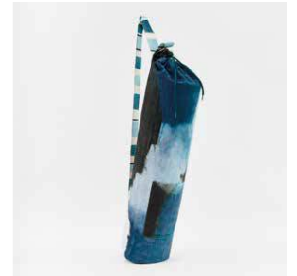
Grey / SKU BYCBE