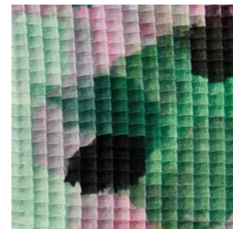
Green & Pink / SKU SPPGP