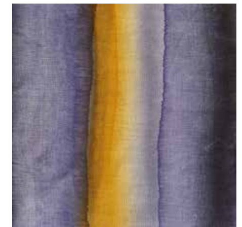
Yellow & Purple / SKU BECYP