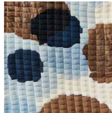
Blue & Chocolate / SKU SPPBC