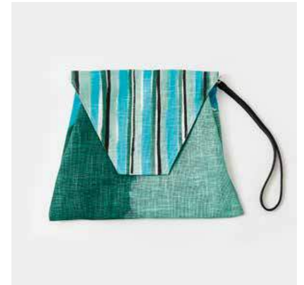
Acqua & Turquoise / SKU BCLAT