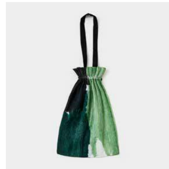
Moss / SKU BTPMS