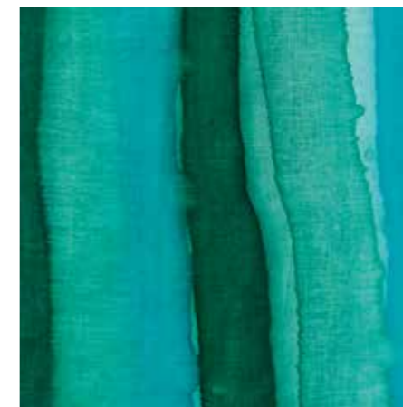
Acqua & Turquoise / SKU BECAT