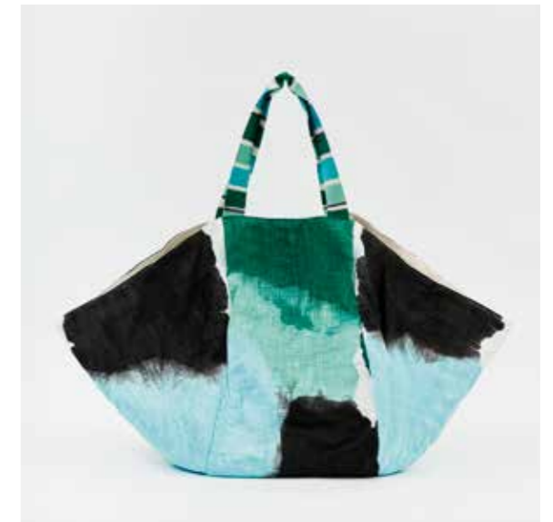
Acqua & Turquoise / SKU BXLAT