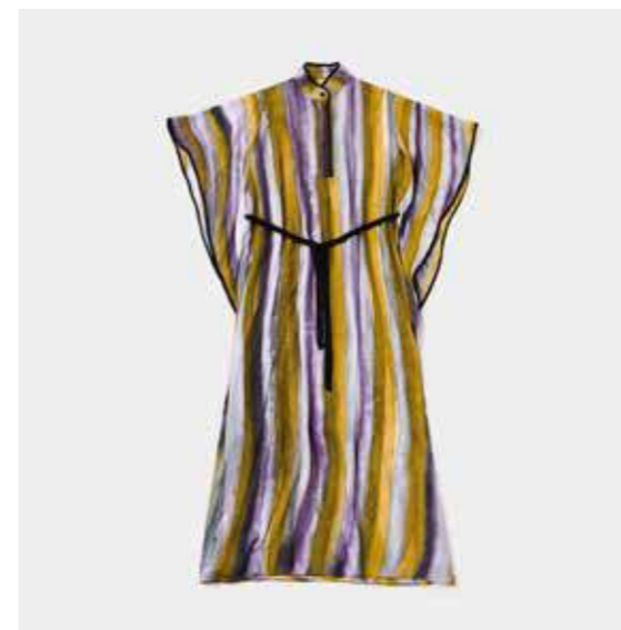
Yellow & Purple / SKU TCYP2