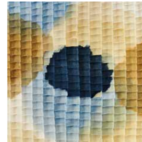
Gold & Blue / SKU SPPBG