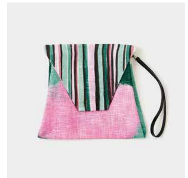
Green & Pink / SKU BCLGP