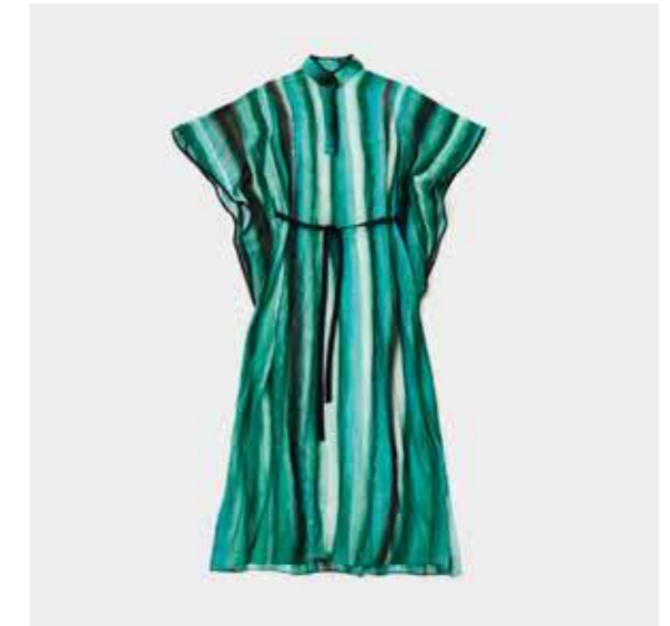
Acqua & Turquoise / SKU TCAT2