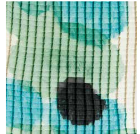
Acqua & Turquoise / SKU SPPAT