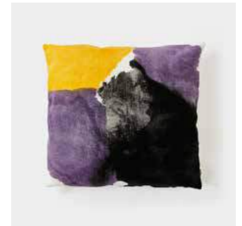
Yellow & Purple 20" x 20" / SKU HCLYP1 24" x 24" / SKU HCLYP3