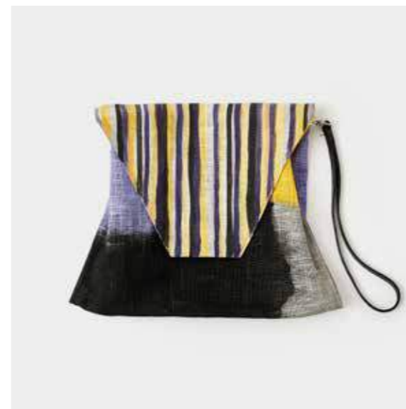
Yellow & Purple / SKU BCLYP