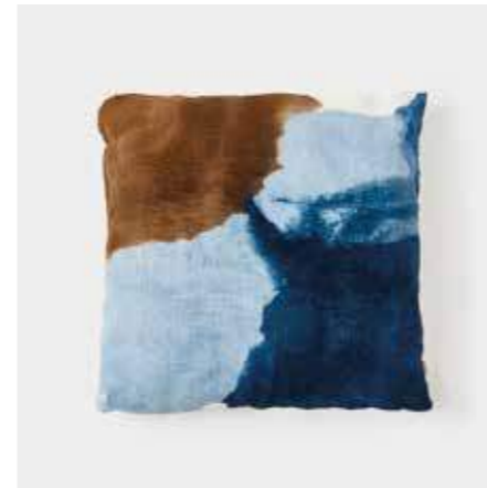
Blue & Chocolate 20" x 20" / SKU HCLBC1 24" x 24" / SKU HCLBC3

Size 24" x 24" | $ 100 60 cm x 60 cm Net Weight 0.43 lbs / 0.195 kg