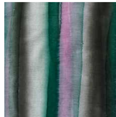
Green & Pink / SKU BECGP