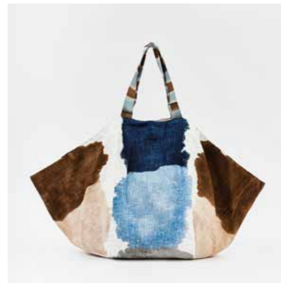
Blue & Chocolate / SKU BXLBC