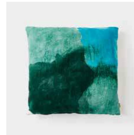
Acqua & Turquoise 20" x 20" / SKU HCLAT1 24" x 24" / SKU HCLAT3