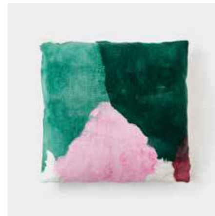
Green & Pink 20" x 20" / SKU HCLGP1 24" x 24" / SKU HCLGP3