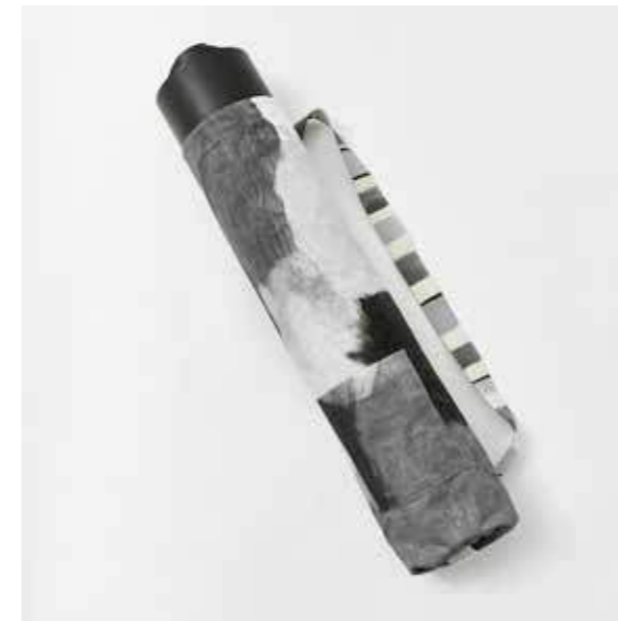
Blue / SKU BYCGY