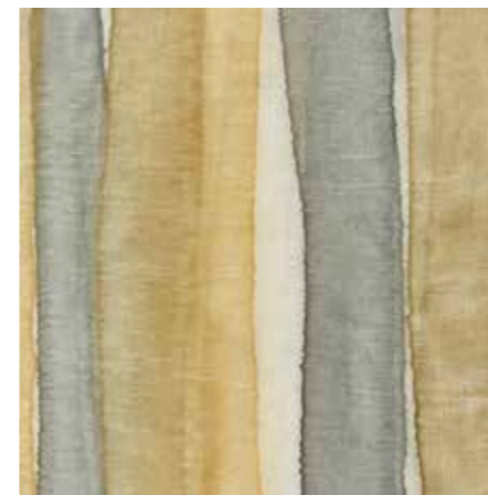
Gray & Golden / SKU BECGG