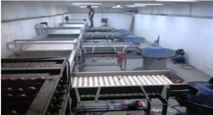
ONIONS SELECTION & PACKING