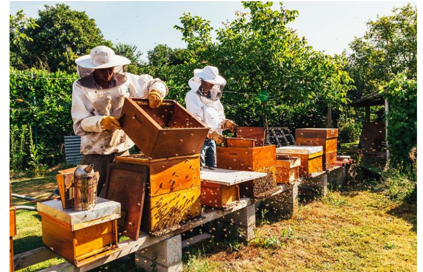
HONEY - BEE