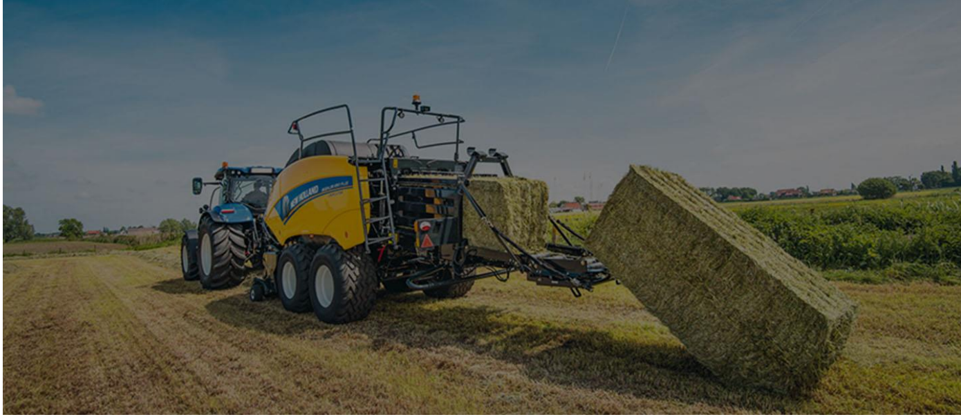
ALFALFA PACKING ON LAND